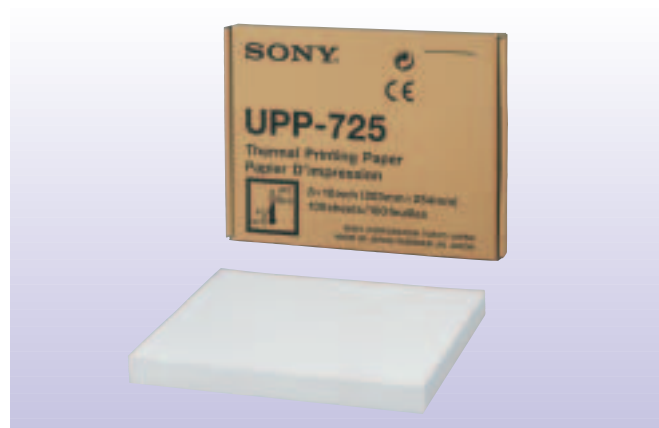
UPP-725 Thermal Paper Printing Pack